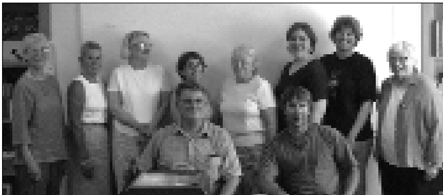
June's Tutor Training Group

Author of WINTERING WELL (2004) and SHADOWS AT THE SPRING SHOW (2005).